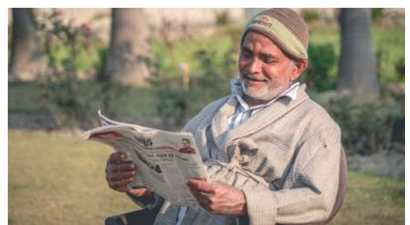
REHABILITATION TO HOME.

There are times when the rescued citizens are simply lost and have no way that leads them back home. We not only work towards the idea of saving and serving the elderly citizens rescued, but we also work for the ones who simply need to get reunited with their families