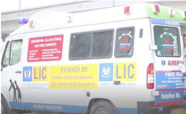
FREE AMBULANCE SERVICE

We are practicing organic farming and raising cows, to reduce the consumption of adulterated foods.