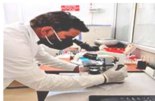
Hi-tech Pathology Lab

The In-house pathology lab allows prompt results and ensure accurate diagnoses. This decrease the dependency on external sources.