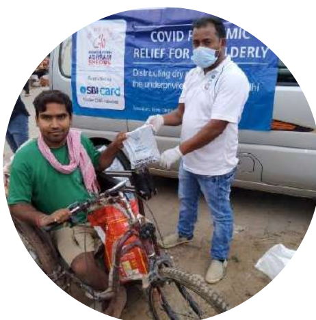
HYGIENE KIT DISTRIBUTION TO 9000 ELDERLY RESPECTIVELY