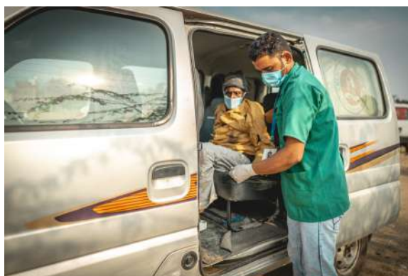
24X7 RESCUE AVAILABLE

Our rescue vehicle goes around Delhi NCR 24x7 and rescues needy elderly.