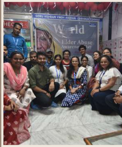
WORLD ELDER ABUSE AWARENESS DAY