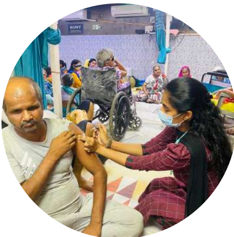
BOOSTER DOSE DONE