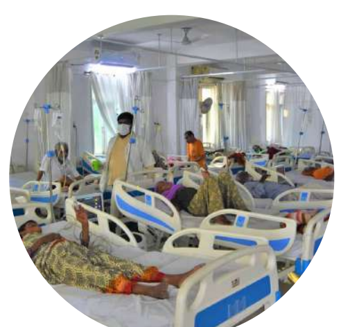
SPECIAL CARE UNIT