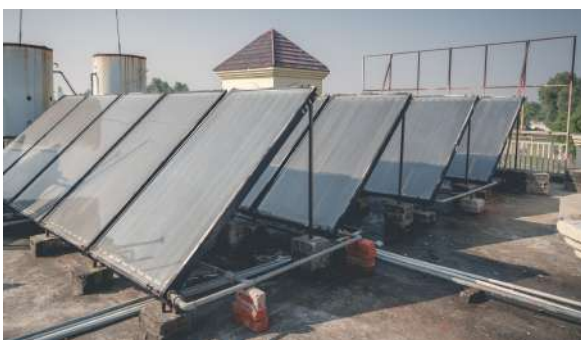
SOLAR POWERED CENTRE

Solar power panels were installed in the old age homes to create a sustainable source of electrical power supplying electricity to the residents. Our Garhmukhteshwar Ashram is equipped with a total of seventy-five solar panels providing 75 Kilowatt of power to the center.