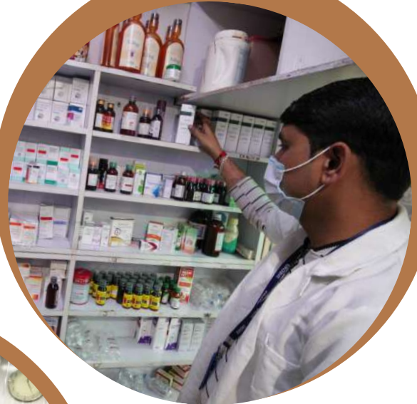
AVAILABLE 24*7 PHARMACY SERVICES