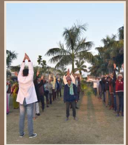
INTERNATIONAL YOGA DAY