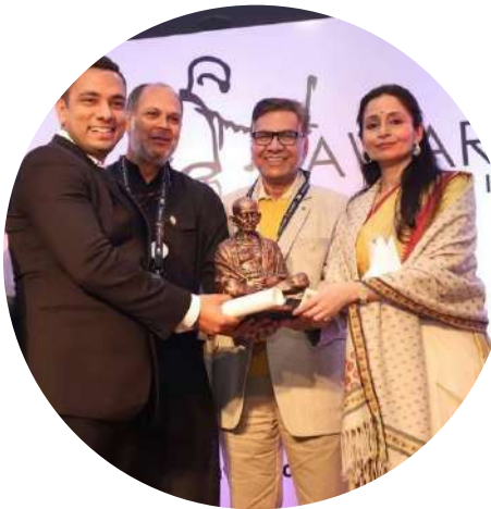
MAHATMA AWARD FOR ELDERLY CARE