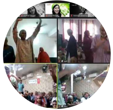
VIRTUAL VOLUNTEER ENGAGEMENT