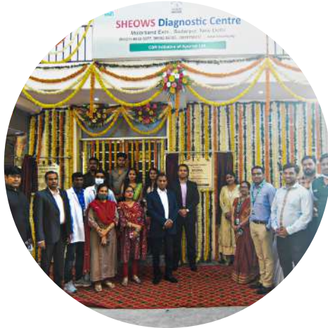
MEDLAB DIAGNOSTIC INAUGURATED