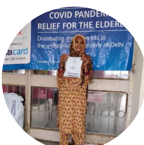
RATION DISTRIBUTION TO 9000 ELDERLY RESPECTIVELY