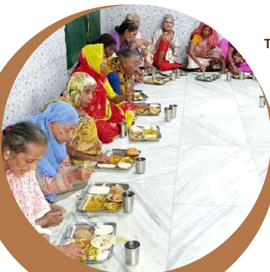
ANNUALLY 5,40,000 NUTRITIOUS MEAL PROVIDED