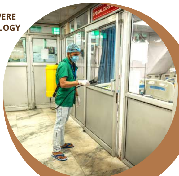
ADHERING TO ALL COVID-19 PROTOCOLS