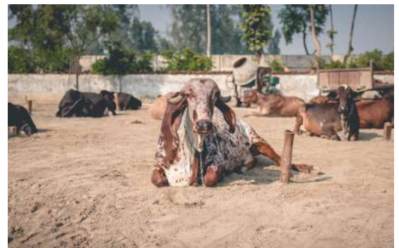
ORGANIC FARMING AND GAUSHALA

We are practicing organic farming and raising cows, to reduce the consumption of adulterated foods.