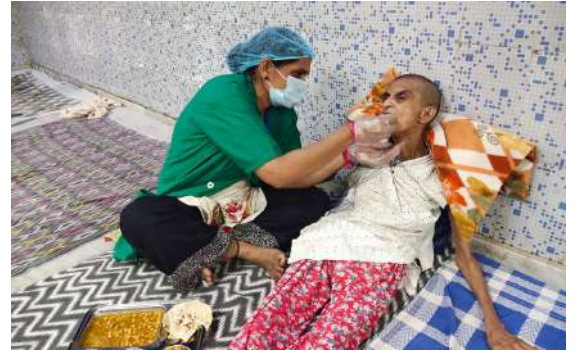
PALLIATIVE/ GERIATRIC CARE

It focuses on improving the symptoms, dignity, and quality of life of beneficiaries who are approaching the end of their lives.