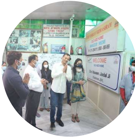
MR. NAVEEN JINDAL VISITED BADARPUR ASHRAM