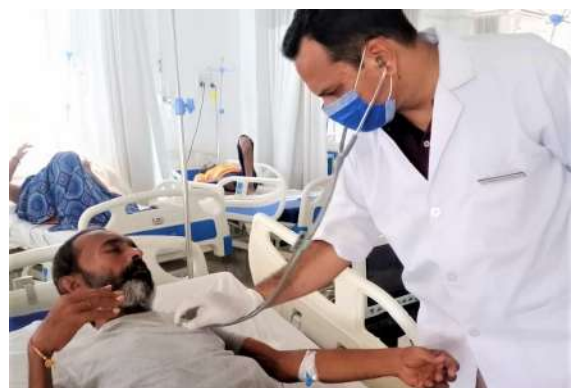
24X7 WELL TRAINED MEDICAL STAFF

Well-trained staff who are equipped to tackle any emergency situations and save the lives of our beneficiaries..