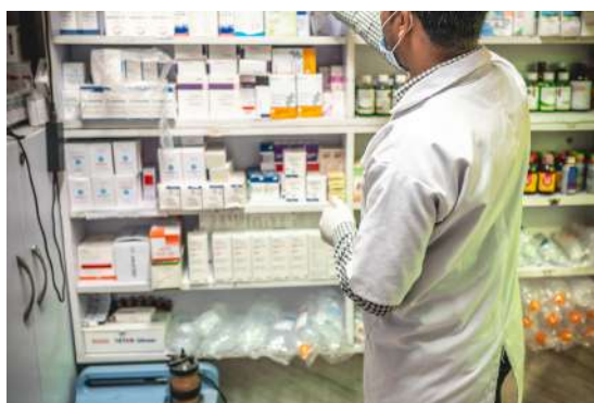
24*7 IN-HOUSE PHARMACY

Our well-trained staff are equipped to care for patients who are suffering from dementia and are unable to take care of themselves.