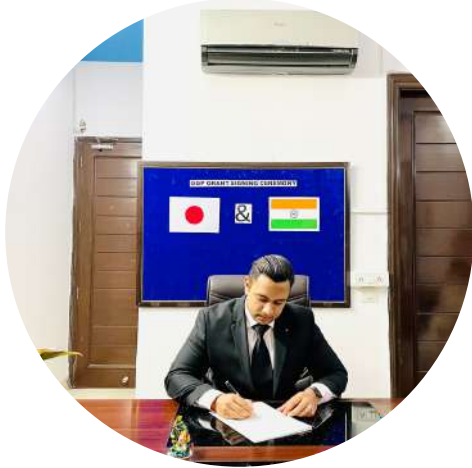
GPP GRANT SIGNING