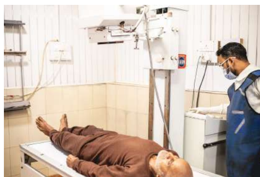
DIGITAL X-RAY CENTRE

Digital X-Ray provides better-quality images, prompt access, and storage, it also causes a small number of radiations and it also reduces environmental impact as they reduce the amount of chemical waste.