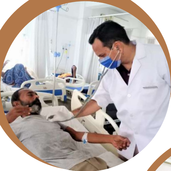
EMERGENCY TREATMENT OF 400 ELDERLY