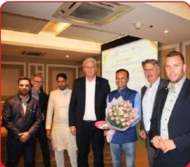
Building bridges: German Mayor Delegation team meets Indian representatives to explore business in Haryana & Punjab