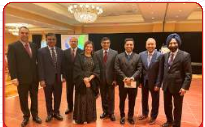
SAPC CFI BOARD OF DIRECTORS