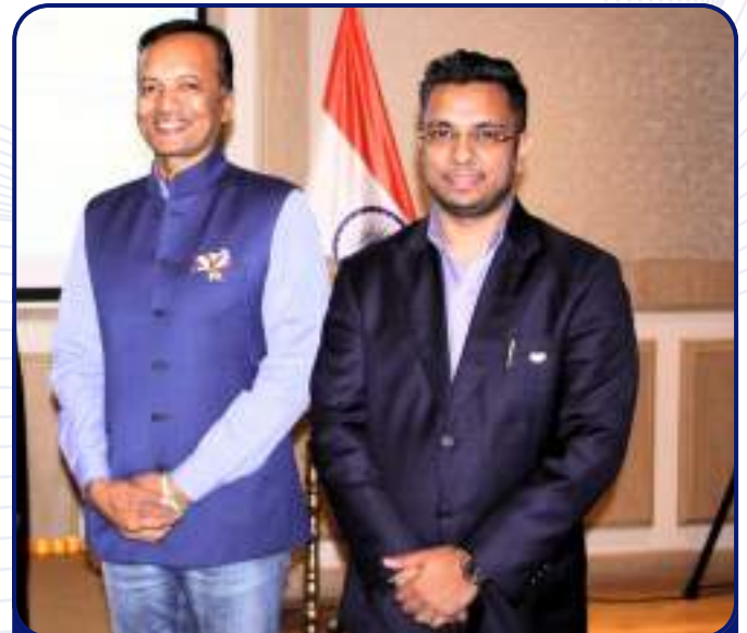
Mr. Naveen Jindal Chairman of Jindal Steel & Power, Honourable Member of Parliament .