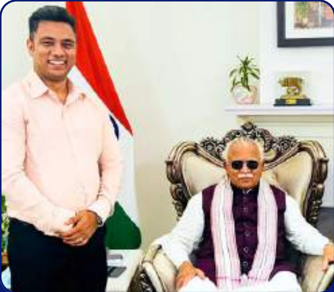
Shri. Manohar Lal Khattar Minister of Housing and Urban Affairs of India