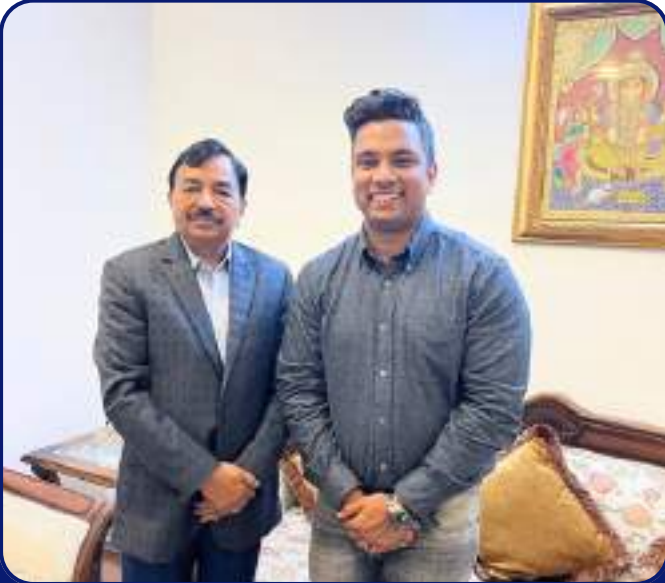
SHRI. SUSHIL CHANDRA, 24TH CHIEF ELECTION COMMISSIONER, MEMBER OF THE LOKPAL COMMITTEE