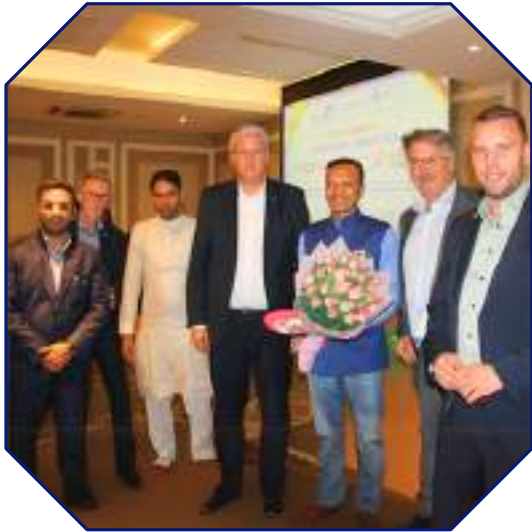
Building bridges: German Mayor Delegation team meets Indian representatives to explore business in Haryana & Punjab