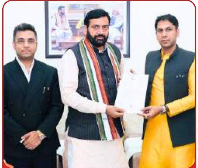
Shri. Nayab Singh Saini, Hon'ble Chief Minister, Haryana .