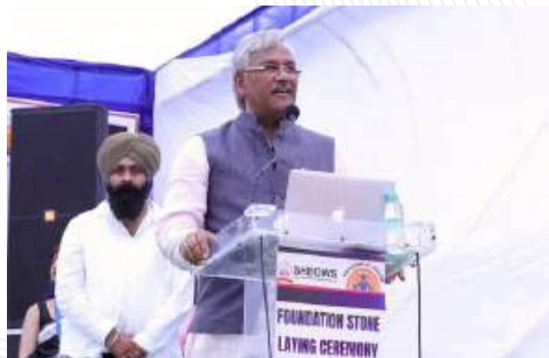
Shri Trivendra Singh Rawat, Former Chief Minister and Member of Parliament, Uttarakhand, addressing the audience.